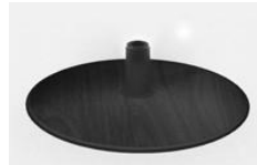
RB-OB round base oak burnt